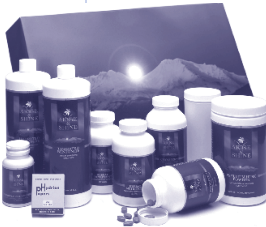
The Complete Cleanse Kit

Flora Grow provides the healthy intestinal bacteria (flora) that may be depleted by years of poor eating habits, and cleansing. Proper bacteria are essential for a strong immune system, thorough digestion, assimilation of nutrients, and the manufacture of B-Vitamins (including B-12), Vitamin K and various amino acids.